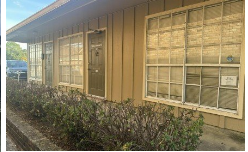
8676 Goodwood Blvd, Suite 201 Baton Rouge, La 70806 675 RSF